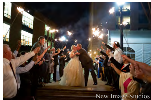
New Image Studios

Host all of your wedding weekend events at The Blackwell Inn! Ask about Rehearsal Dinner and Farewell Brunch options within our on-site restaurant, Bistro 2110, and our private event spaces.